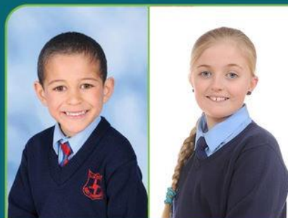
Your School Name Here