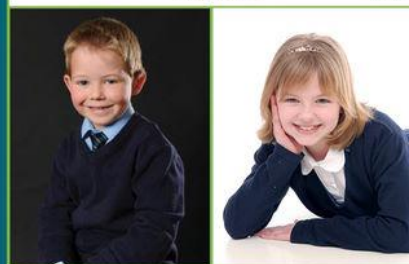
Your School Name